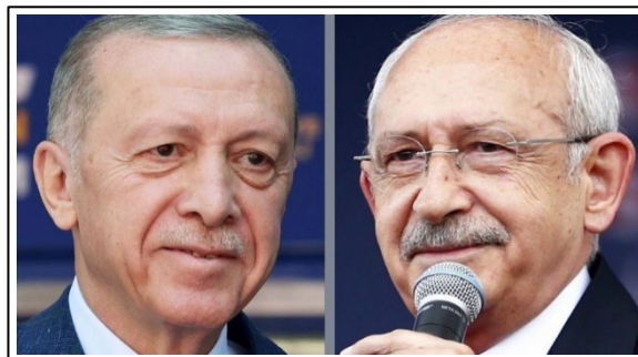
Erdoğan and Kılıçdaroğlu

Turkey falls into the former category. The reason is quite simple: although there are several consumer names on our Watch List and a couple on our Focus List, none have made it into the portfolio for a number of years. The reasons are simple: (i) there have been more compelling stocks elsewhere and (ii) the macro situation in the country has provided sturdy headwinds and political risk. As you know, over the last 10 years the Turkish Lira has gone from 1.85 to the USD to 19.76. Quite a challenge for even the best run company. Even more so for a USD based investor.